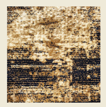
NZ 51 | NAVY BLUE/GOLD

The Design is inspired by urbanisation . It reflects the dynamic , diverse and evolving nature of the cities. From sleek skyscrappers of modern metropolis to the historic charms of cobblestone streets and classical buildings , NOZTI offers a rich tapestry of influences for designers.