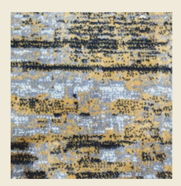
NZ 41 | NAVY BLUE/GREY

The Design is inspired by urbanisation . It reflects the dynamic , diverse and evolving nature of the cities. From sleek skyscrappers of modern metropolis to the historic charms of cobblestone streets and classical buildings , NOZTI offers a rich tapestry of influences for designers.