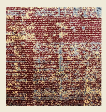
NZ 31 | RED/GREY

The Design is inspired by urbanisation . It reflects the dynamic , diverse and evolving nature of the cities. From sleek skyscrappers of modern metropolis to the historic charms of cobblestone streets and classical buildings , NOZTI offers a rich tapestry of influences for designers.