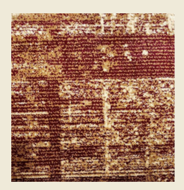
NZ 21 | RED/GOLD

The Design is inspired by urbanisation . It reflects the dynamic , diverse and evolving nature of the cities. From sleek skyscrappers of modern metropolis to the historic charms of cobblestone streets and classical buildings , NOZTI offers a rich tapestry of influences for designers.