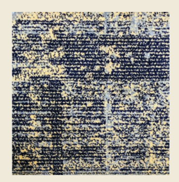
NZ 41 | NAVY BLUE/GREY

The Design is inspired by urbanisation . It reflects the dynamic , diverse and evolving nature of the cities. From sleek skyscrappers of modern metropolis to the historic charms of cobblestone streets and classical buildings , NOZTI offers a rich tapestry of influences for designers.