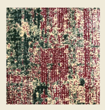
NZ 11 | RED/GREEN

The Design is inspired by urbanisation. It reflects the dynamic, diverse and evolving nature of the cities. From sleek skyscrappers of modern metropolis to the historic charms of cobblestone streets and classical buildings, NOZTI offers a rich tapestry of influences for designers.